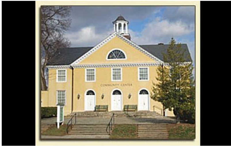
Middleburg Community Center

Middleburg is 20 minutes from the Shenandoah River which is great for swimming, boating and excellent large- mouth bass fishing . Also, we are not far from Sky Meadows State Park – the number one state park in the country according to the US Government.