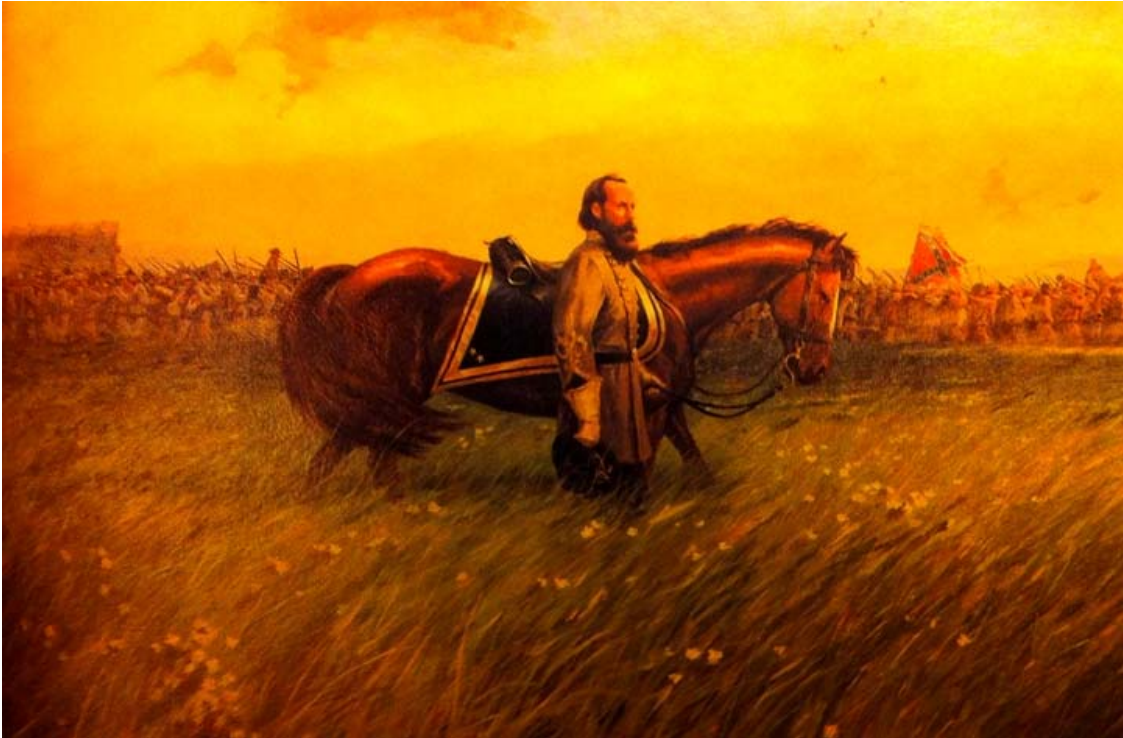
Lt. General James Longstreet pauses to gaze as he and his beloved First Corps march to Gettysburg West of Middleburg– June 1863.

Finally, for you joggers and for me, I have found over three hundred miles of old flat dirt roads with little traffic around the Middleburg area. To find the roads that I use every day for jogging get the county maps for Loudoun and Fauquier Counties. It is truly a jogger's paradise.