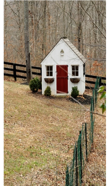
Child's Play House