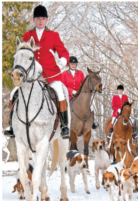
The Middleburg Hunt and the Huntsmen.

The above tells you how special Eden Glen Park is as is its surrounding area.