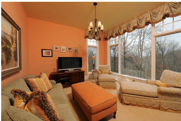
Master Suite Sitting Room