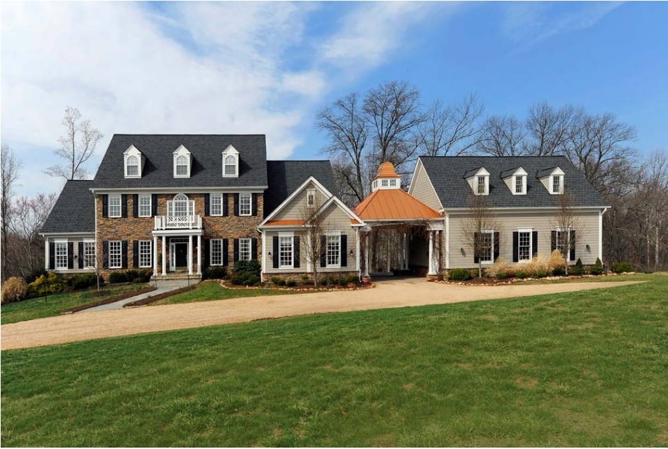
Eden Glen from the gated front lawn.