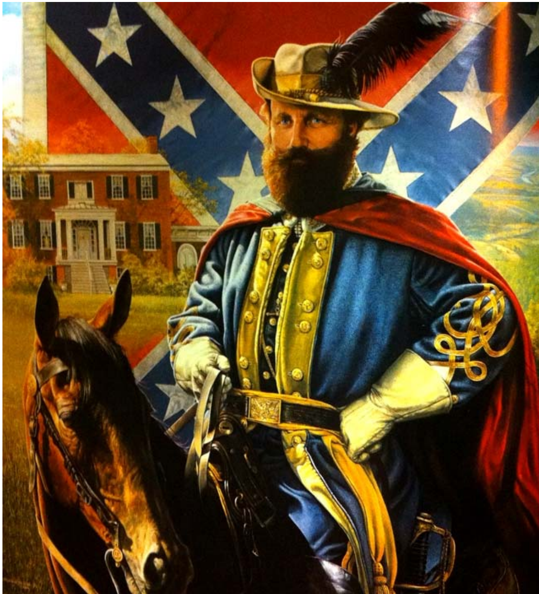
The Last Cavalier

Jeb Stuart, who fought light cavalry like no one ever has; embodies the look and spirit of the Southern Army.