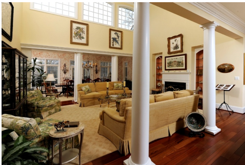
Formal Living Room and Dining Room