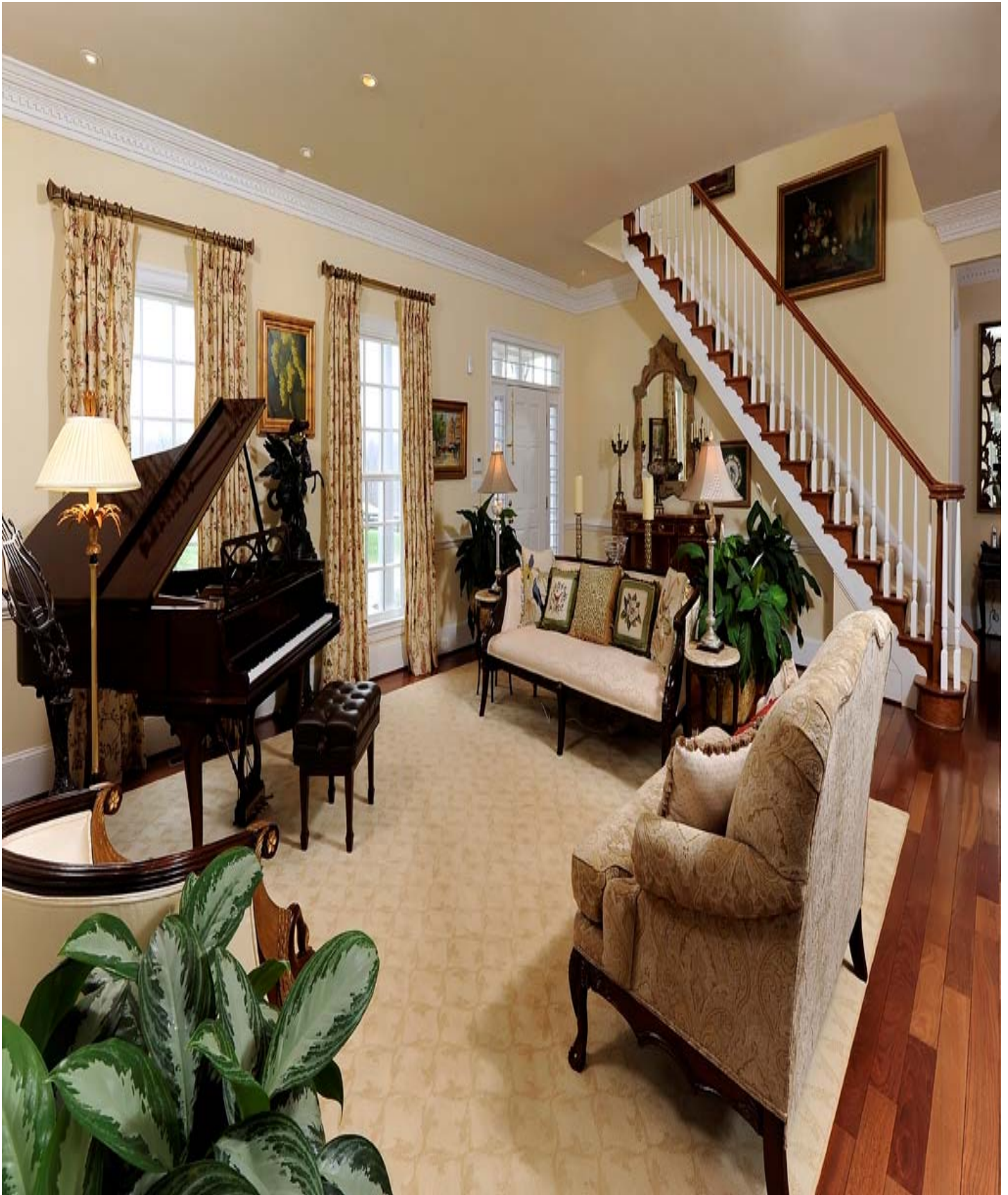
Old Fashion Southern Music Room