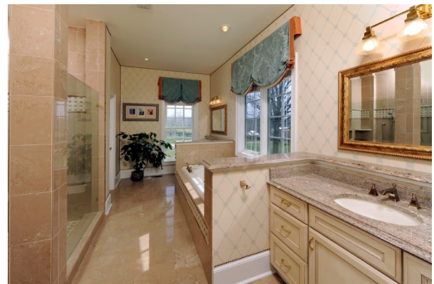
Master Suite Bathroom